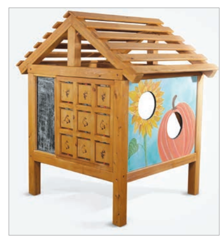
The Curiosity Corner, a K-Play favorite post-and-beam creation.

Their first item of business in Sandisfield will be to build a showroom for their products and possibly an outdoor showplace. Work won't begin on the site until spring, and the hope is to open the showroom by the end of summer. "Be patient with us," they said.