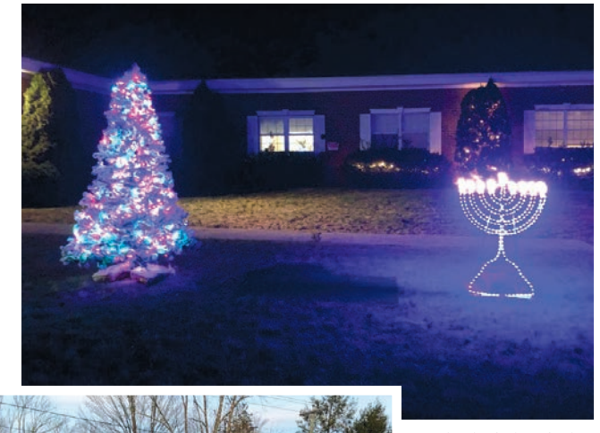
The holiday lights at Berkshire Rehab, and local residents gathered for the ceremony.

After the performance all were treated to cookies and hot chocolate donated by the Rehab Center. Thanks to everyone who supported us and turned out, especially to all who sang along with the kids!