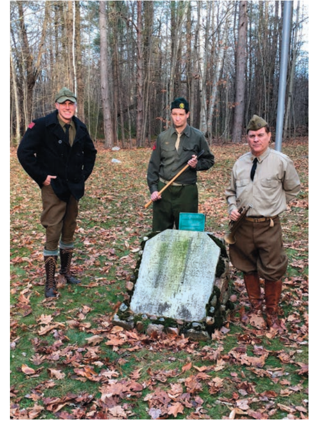
At last year's ceremony.

A wreath-laying ceremony honoring members of the Civilian Conservation Corps will be held Friday, December 16 at 2:30 p.m. by Department of Conservation & Recreation State Park staff.