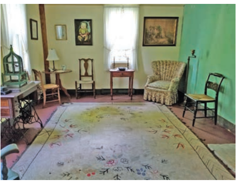
After: the front parlor restored.

With the paneling gone, I dry-scraped the base-board to reveal the original charcoal-gray paint – a color that would have complemented the gray veins of the faux marble mantle. I painted the paneling on the other three walls a light cream and painted their base-boards to match the gray of the original.