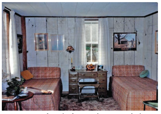
Before: the front parlor as guest bedroom.

The faux marble mantle featured in Part 2 of this series wasn't the only outstanding feature of the front parlor of the house on Town Hill Road: The entire room was featured in art historian Janet Waring's 1937 book about early homes. She described in detail