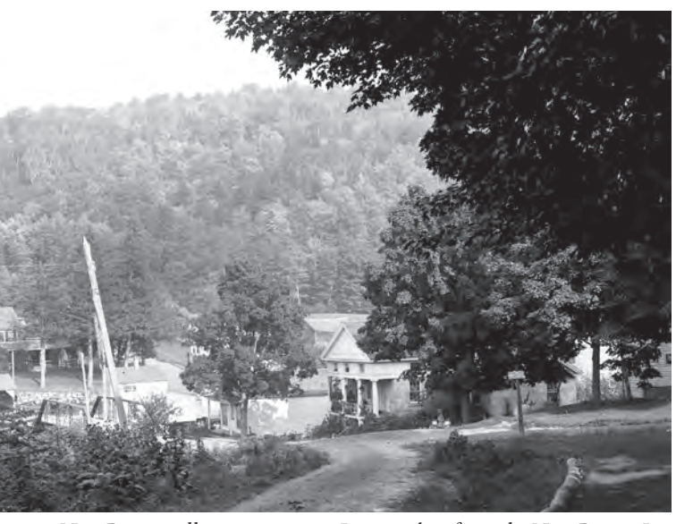
New Boston village, circa 1905. Image taken from the New Boston Inn looking east to the former New Boston store (today Murray) and the old Twining place (Hoekstra). The Old Stone House is on the right (Levine). Also visible, straddling the Farmington River, are the former Ladies Aid Society building and the Norton house, both defunct.

Sandisfield is proud of its three National Register listings: The New Boston Inn, The Montville Baptist Church (now home of the Arts Center), and the Philomen Sage House in South Sandisfield. The official survey includes