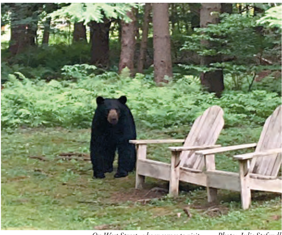
On West Street, a bear comes to visit.