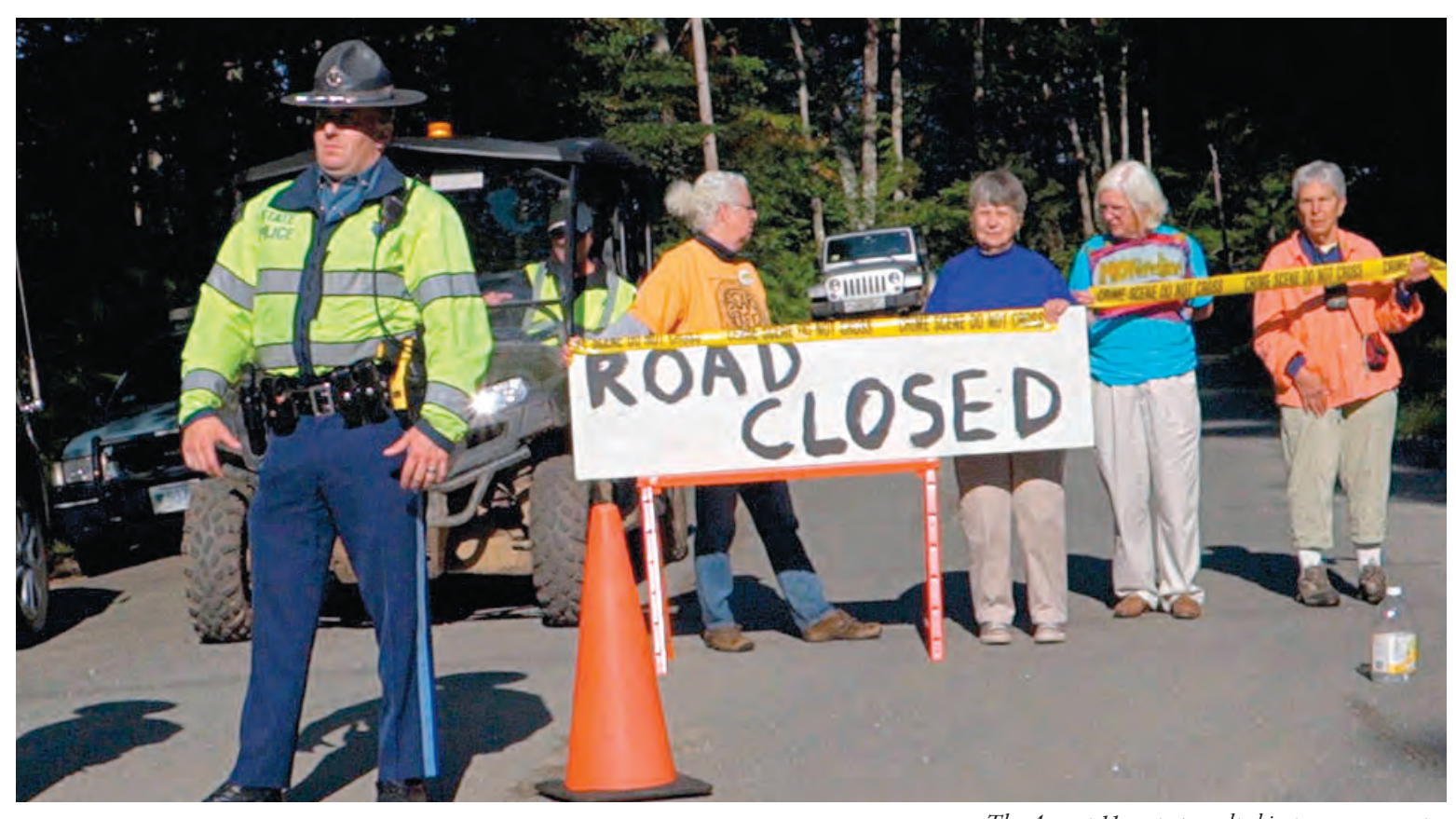
The August 11 protest resulted in ten more arrests.