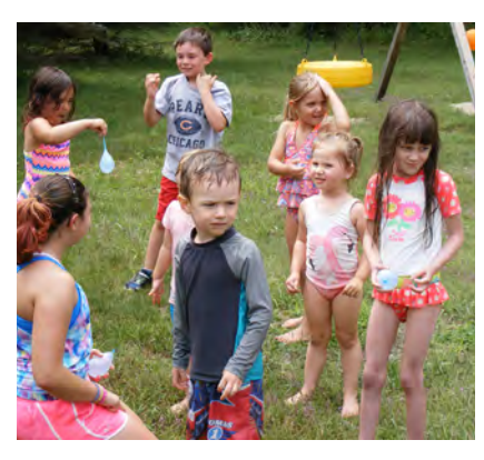
Trying to get organized for the water balloon toss at the "beach party" behind the Library.

On June 24 we held our annual "End of School Picnic/Splash" at Tolland State Park.