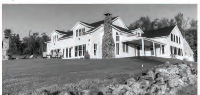
LUXURY & PRIVACY! Stunning 6 BR Colonial , Kitchen with Wolf Range, Subzero fridge, Great Room+stone fireplace; Full Home Automation. Amazing land & views! $1,750,000

Chapin Fish, Broker-Partner 413-258-4777