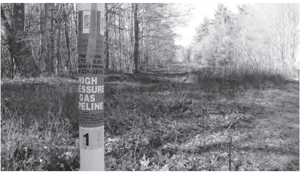
The pipeline now, November 2013

Subjects should be interesting to most of us and have a strong link to Sandisfield, written by and for Town residents. Address either PO Box 584, Sandisfield, or email editor@sandisfieldtimes.org