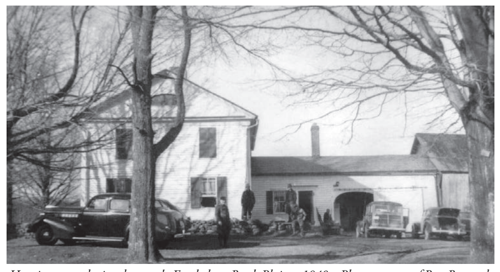
Hunting party during deer week, Etzel place, Beech Plain, c.1940s.

Arguably the two most popular seasons are turkey and deer. For turkey this year, the Fall sea-