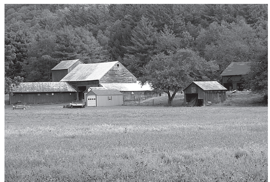
Begun in the 1800s, the barns are still "works in process."

It's possible that Valley View has been farmed since the town was settled. Described as the Elizur Deming Farm in Sandisfield Then and Now , it was first deeded in 1787.