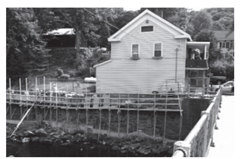
Tannery Road gets a very necessary and improved shoring-up.