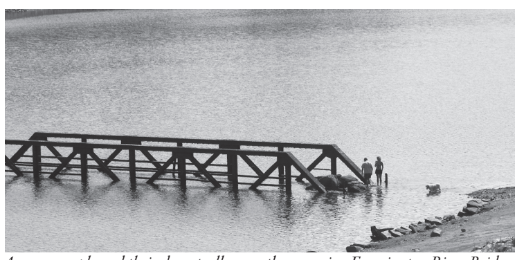
A young couple and their dogs stroll across the emerging Farmington River Bridge. with a suggested donation of $5 per person.)

If you missed "Rascals & Others" opening night of the 250th Celebration or were turned away because too many people were already inside or you want to see it again, you have another chance. See the ad on page 5. The play was filmed using double cameras during its original production. Now professionally edited, it will be shown October 6, Saturday, at 7 p.m. and the 7th, Sunday, at 3. (Free,