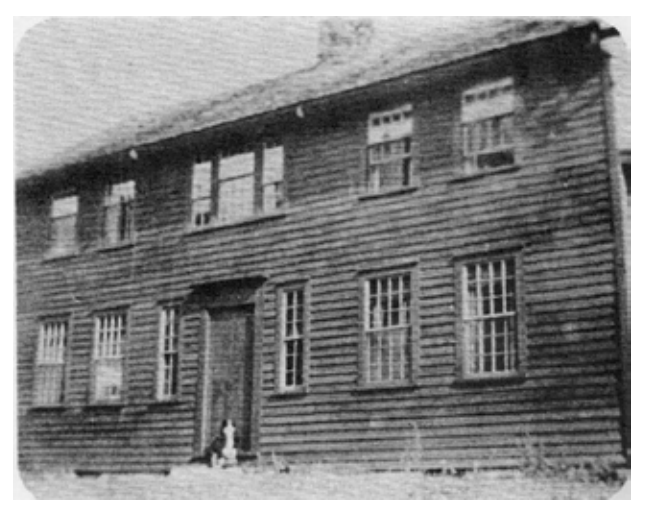
Early image of the 10-room c.1770s Issac Norton House that stood near Beech Plain Road on the Otis side of the town line. It burned in 1978.

The camp operated for only a few years, without incident, but it created a considerable buzz among Otis residents. Membership was not significant so Harrington lost interest and sold most of the land by 1937. In 1958, The Con-